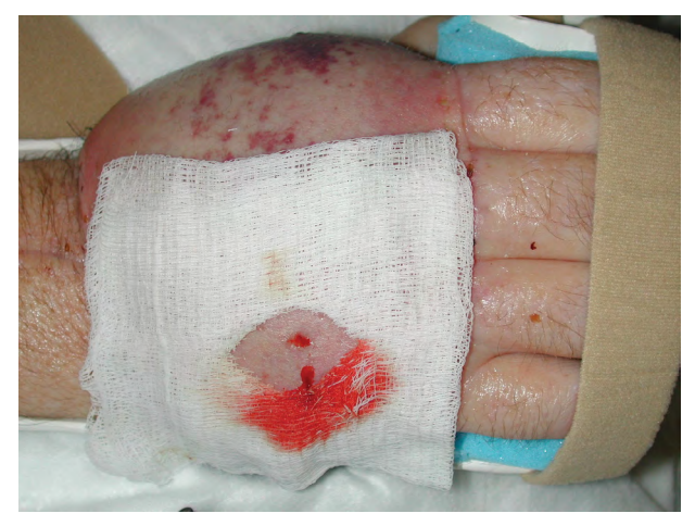
Fig. 4. Leech bite wound with passive oozing.