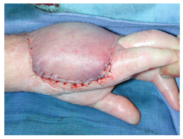
Fig. 1. Local flap indicating signs of venous congestion.